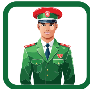
Commander in Chief