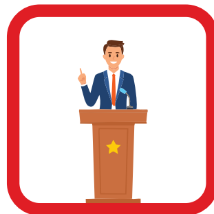
Chief of Justice