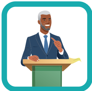
President of Maldives