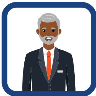
Speaker of Majlis